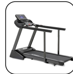
Optional Extended Handrails