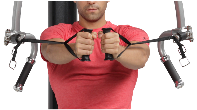
STRAP HANDLES WITH 3 LENGTH CHOICE RINGS