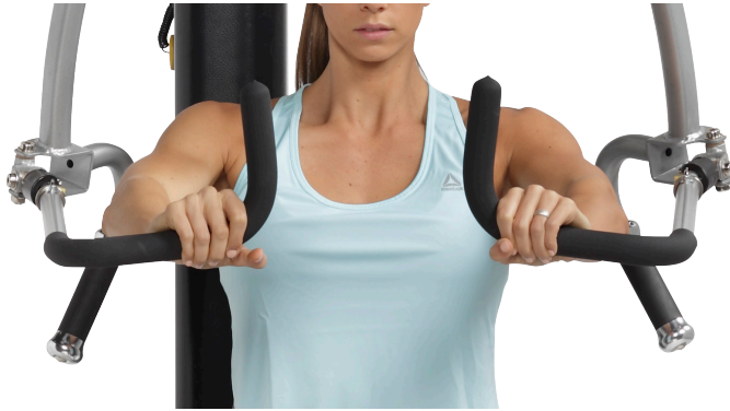
ARTICULATING PRESS HANDLES