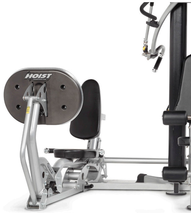
V RIDE LEG PRESS

Free HOIST Strength app provides access to dozens of exercise tutorials, workout plans and fitness training