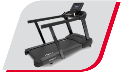
Optional Extended Handrails

The CT800ENT treadmill, built on the durable CT800 platform, combines advanced features with affordability. Its 15.6" touchscreen lets users mirror their phone for custom entertainment, while pre-loaded apps offer popular streaming content. With a heavy-duty build and an impressive warranty, this treadmill delivers premium features at a great value.